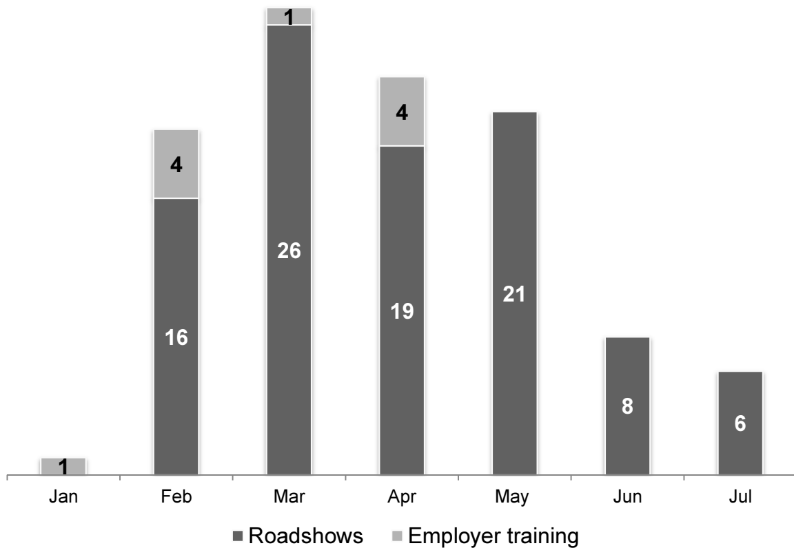
Number of roadshows / training sessions (as of 14 March)